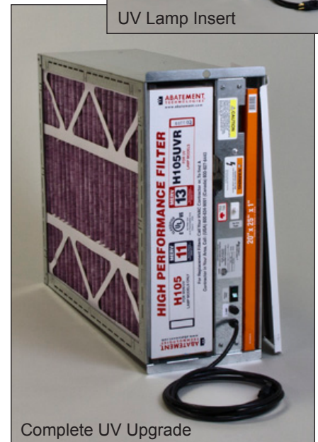
Complete UV Upgrade