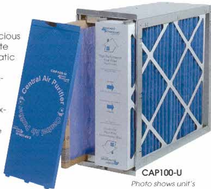
CAP100-U Photo shows unit's two-stages of filtration

The CAP100-U features two stages of filtration. An inexpensive 1" prefilter removes coarse particulates. A 5" pleated cartridge filter captures up to 96% of the invisible particles such as fine dirt and dust, animal hair and dander, soot, mold spores and pollens — particles that pass right through inexpensive furnace filters. This high-performance filter features a low pressure drop and excellent dirt-holding capacity.